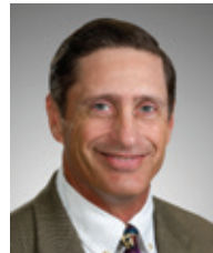
Laval Simons District 7 Port Lavaca